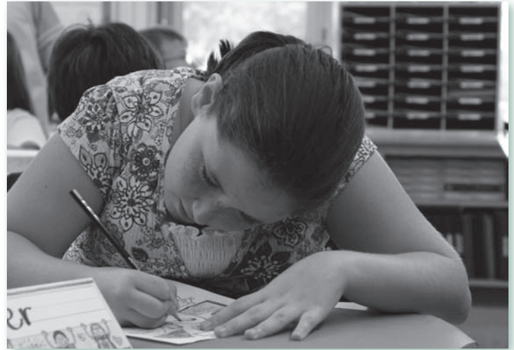
Everyone in the Rush-Henrietta Central School District is focused on student learning.

Rush-Henrietta takes pride in sharing some great news regarding student achievement. As reported in a May 16, 2008, Democrat and Chronicle story titled "Area Schools Praised," Rush-Henrietta schools are among those being congratulated by the New York State Education Department. The state named all Rush-Henrietta schools as High Performing/Gap Closing Schools for the 2006-2007 school year, as per information documented in the link provided in the newspaper story. High Performing/Gap Closing schools met all applicable state standards for English Language Arts (ELA) and math during the 2006-2007 school year and also made Adequate Yearly Progress (AYP) in ELA and math for two consecutive years. Rapidly improving schools are those that took aggressive action and have shown real progress in meeting performance challenges. To learn more, please