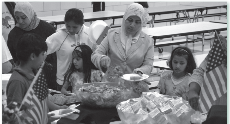
People from all around the world live in Rush-Henrietta, providing students with unique learning opportunities.

Rush-Henrietta held its English as a Second Language (ESL) Family Picnic in June 2008 at Winslow Elementary School. Scores of families attended the annual event. Special events such as the ESL Family Picnic afford our school community an opportunity to experience and better understand the culture, customs, and traditional dress of others living worldwide. Rush-Henrietta's diverse population offers our students a unique learning opportunity, which is particularly useful as we prepare each of them for success in a global community. To view a photo gallery containing dozens of photos from the ESL Family Picnic, visit www.rhnet.org/eslpicnic .