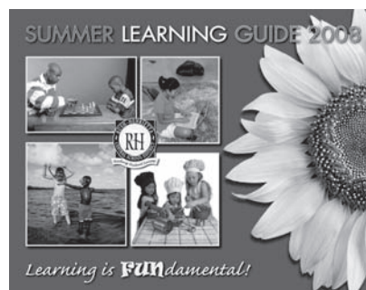
The 2008 Summer Learning Guide aims to stem the "summer slump."

Rush-Henrietta's Summer Learning Guide, which was sent home with students finishing grades K-5 in June, is meant to help parents and families incorporate learning into daily activities so that children avoid such a slump. Within this publication, Rush-Henrietta teachers provide activities that focus on core content areas and state learning standards. This collection of learning activities is designed to help families support and encourage learning through summer break and includes suggestions for exploring new ideas. These include visiting new places, reading, writing, taking hikes, learning new games, and planting a garden. We hope this guide will help you keep learning alive for your family this summer.