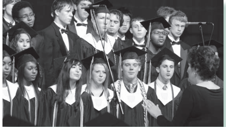
Rush-Henrietta's music program again was ranked as one of the best in the nation.